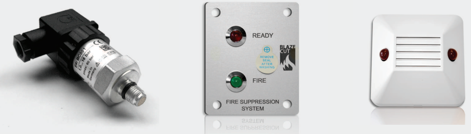
Pressure Switch BC001