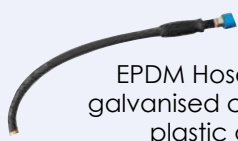
EPDM Hose with galvanised clips and plastic grip