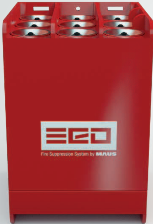
194mm (L) x 186mm (W) x 282mm (H)

EGO Blast can protect spaces from 0,6 m 3 to 500 m 3 in one chain. The Potassium mix inside the EGO Blast series is unique. It does not cause any residues, it extinguishes the fire with aerosol (white smoke) and as long as the aerosol floats in the space the fire will not re-ignite.