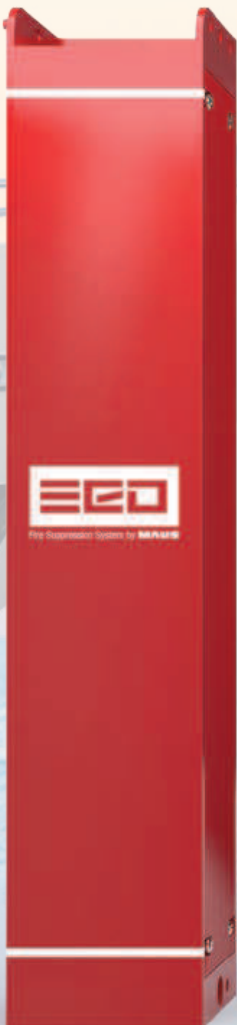
EGO Blast 15

Self Exhausting system for boats, cars and server rooms.