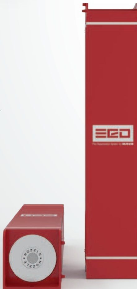
56 x 55 x H272 mm

EGO Blast 15 is the big brother of EGO Blast 6 and together they can protect areas where space is an issue. It can by itself protect spaces up to 1,5 m 3 . Connect it to EGO Kegel or EGO Kontrol.