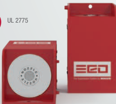
56 x 55 x H94 mm

EGO Blast 15 is the big brother of EGO Blast 6 and together they can protect areas where space is an issue. It can by itself protect spaces up to 1,5 m 3 . Connect it to EGO Kegel or EGO Kontrol.