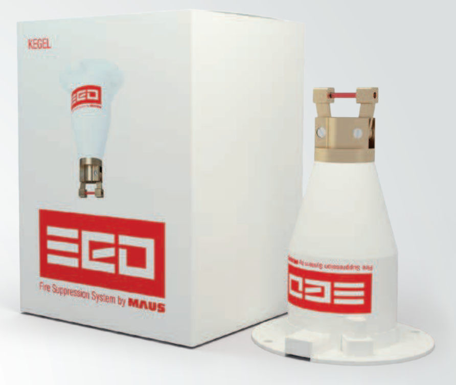
Ø65mm, H 100mm