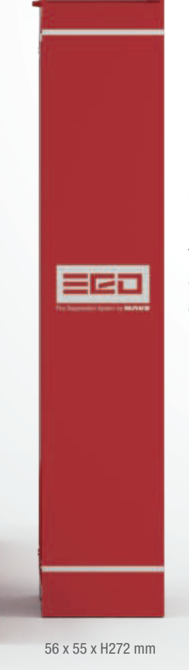
EGO Blast 15 is the big brother of EGO Blast 6 and together they can protect areas where space is an issue. It can by itself protect spaces up to 1,5 m<sup>3</sup>. Connect it to EGO Kegel or EGO Kontrol.