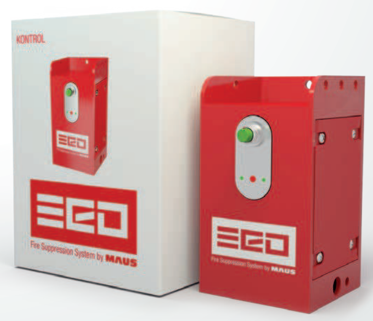
56 x 54 x H94 mm

EGO Kontrol is the control unit for the smaller EGO Blast units. You can use the EGO Kontrol with up to 6 devices (same for EGO Kegel) of the EGO Blast 6 or EGO Blast 15. You connect the heat detecting cable to the EGO Kontrol and then you connect EGO Kontrol to the EGO Blast 6 or EGO Blast 15 with the electrical cables. To test the battery or to test the loop, simply click on the green button and the lights will indicate if everything is in order.