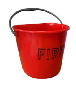
JPFB1 Plastic fire bucket without lid.

H x W x D (mm): 270 x 275 x 220 Weight (kg): 0.675 Capacity (ℓ): 10